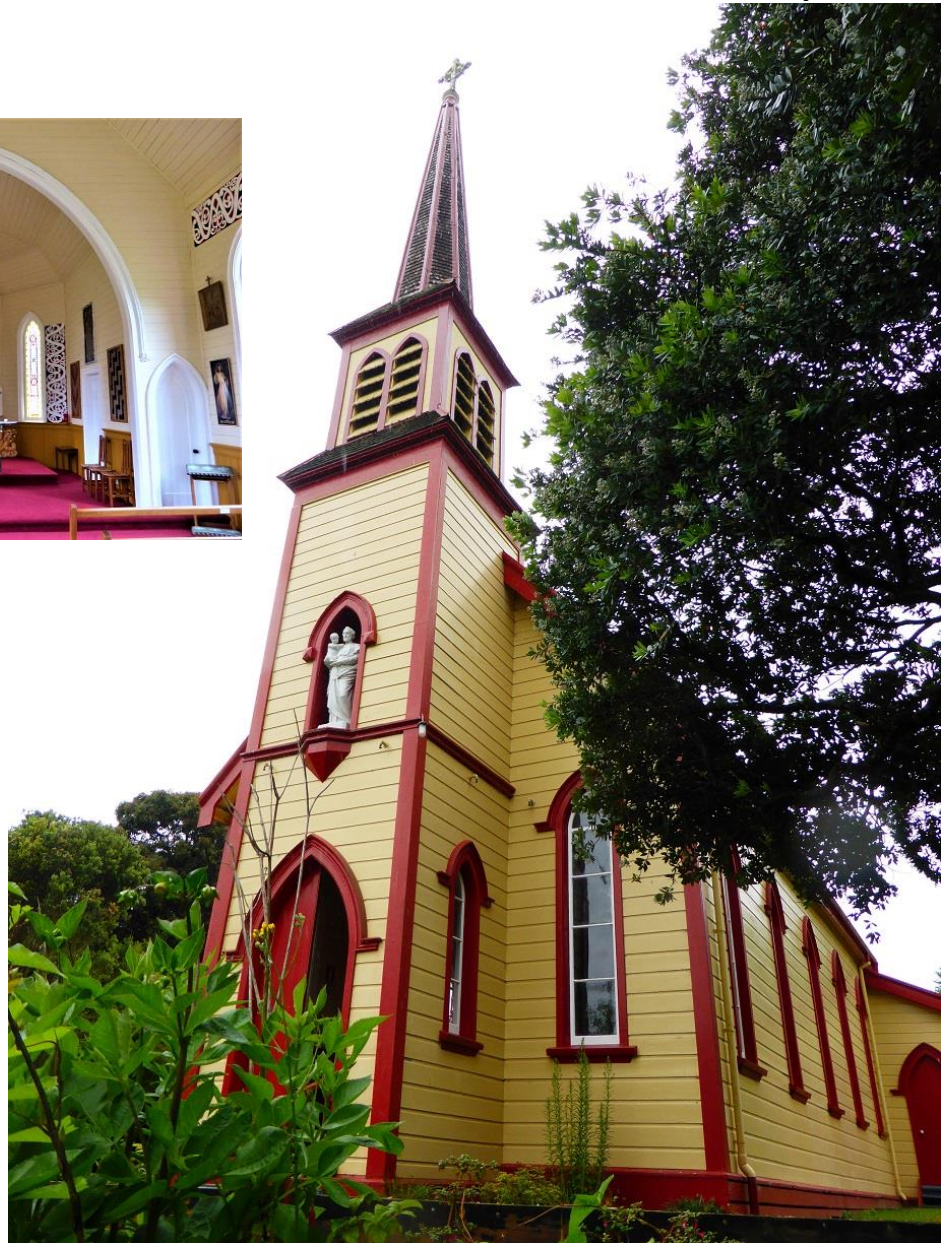
St Joseph's Catholic church, Jerusalem/Hiruhārama.