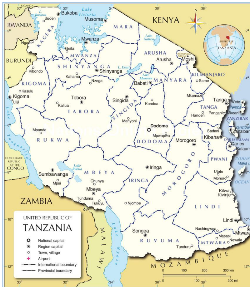
Fig.2. The Tanzanian political map taken from www.nationsonline.org . The Anglican dioceses in central Tanzania indicated in Figure 1 fall mainly within two regions on this political map: Dodoma and Singida. The ACT Diocese of Kiteto is also regarded as part of the central Anglican dioceses: it lies at the bottom of the Manyara region.

It is important to understand that this thesis is not about evangelical mission study in general, nor even mission for the church in Africa. Rather, it is a biblical interpretation and reflection on my own situation and experience in central Tanzania as an evangelical male Anglican priest. I am aware, however, that many people in Tanzania and various other traditional churches face many of the same challenges we do in the ACT. 8 Should my biblical interpretation and reflection be of some relevance to others, I will be humbly grateful. Anglican Christianity in central Tanzania was brought by English CMS missionaries during the era of British colonisation, and ever since no one has tried to interpret and contextualize the mission of the ACT in the light of the NT.