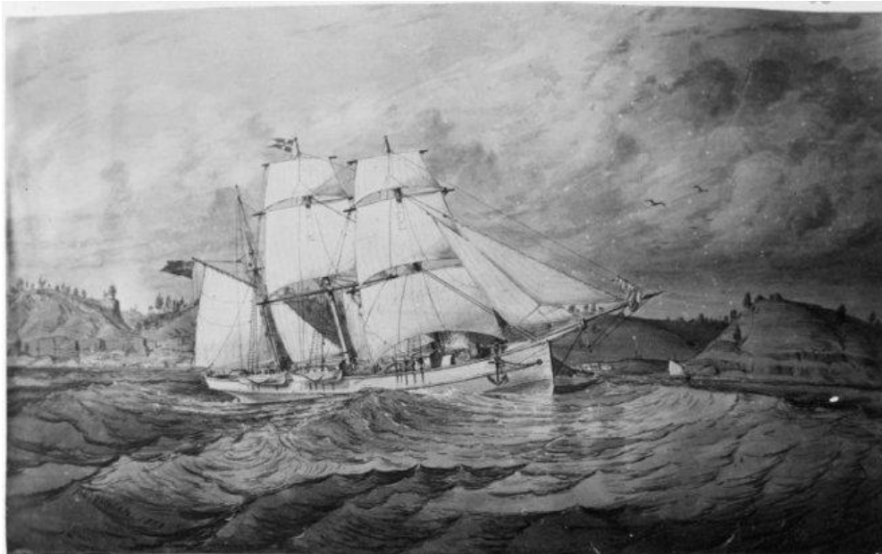
Figure 3: The barque, Southern Cross, used for training, and disciplinary purposes, 1881.

In his report to the Marine Department in 1877, the manager of the school had suggested that, given 'the antecedents' of many of the boys, the ultimate degree of success of the institution could never be certain (AJHR 1877 H-29: 5). Two years into the school's history, the ultimate degree of success began to be measured by the number of students graduating to sea service. Once they had turned twelve, and provided they were considered up to the task, the boys could be apprenticed to the owner or master of any of the British ships registered at or trading in New Zealand. However, only twelve of the boys trained at the school had been successfully placed. As departmental records began to show, masters and owners of ships were reluctant to take them on. Meeting the vocational purpose of the institution was proving to be elusive. Possible solutions were put forward—acquiring properly-trained instructors and a small useable schooner to replace the deteriorating Southern Cross , removal of the expulsion clause in the Act which, the manager felt, provided an incentive for dissatisfied boys to offend, but above all, the establishment of a penal school or reformatory to which the 'criminal element amongst the boys' could be removed (AJHR 1878 H-12: 2). Forcing destitute children to associate on a residential basis with criminal children was believed to be the most logical explanation for any problems the school was experiencing.