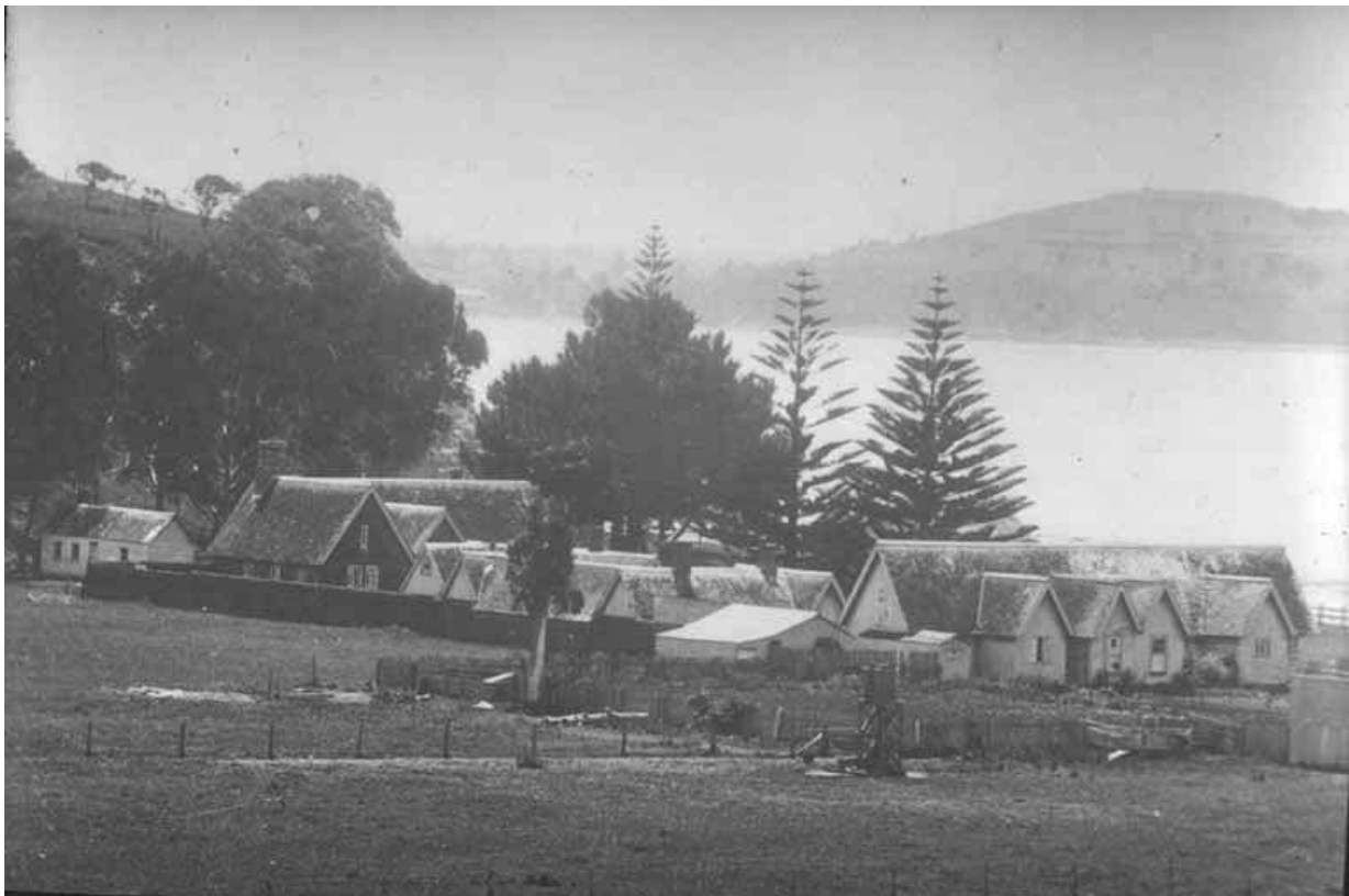
Figure 1: The school buildings looking north west, c. 1895.