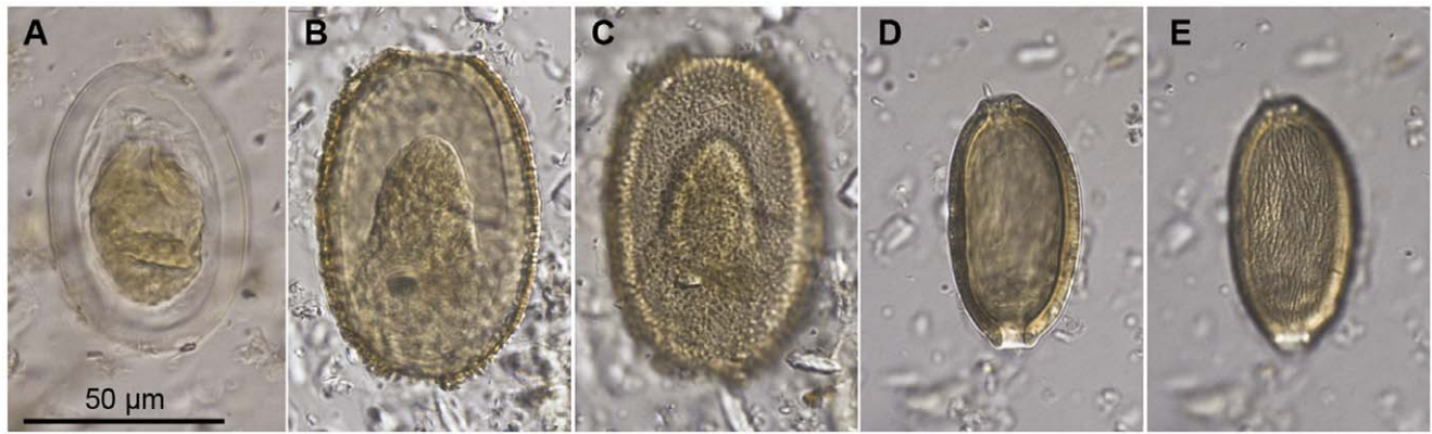
Figure 2. Helminth eggs from moa coprolites. (a), egg type 1, cf. Heterakoidea; (b–c), egg type 2, undetermined Nematoda; (d–e), egg type 3, Trichinellidae cf. Capillaria . doi:10.1371/journal.pone.0057315.g002

robustus from Dart River) were both placed within the suborder Eimeriorina with posterior values of 1.0 and 0.43 respectively (sequence 2 as sister to Calyptosporidae and 3 as sister to all non-Cryptosporidiidae Eimeriorina) (Fig. S7). It should be noted that several families within Eimeriorina (Elleipsisomatidae, Selenococciidae, and Spirocystidae) were not represented in the analysis due to unavailability of 18S sequences on Genbank, and this may have affected the exact placement of clones within this group.