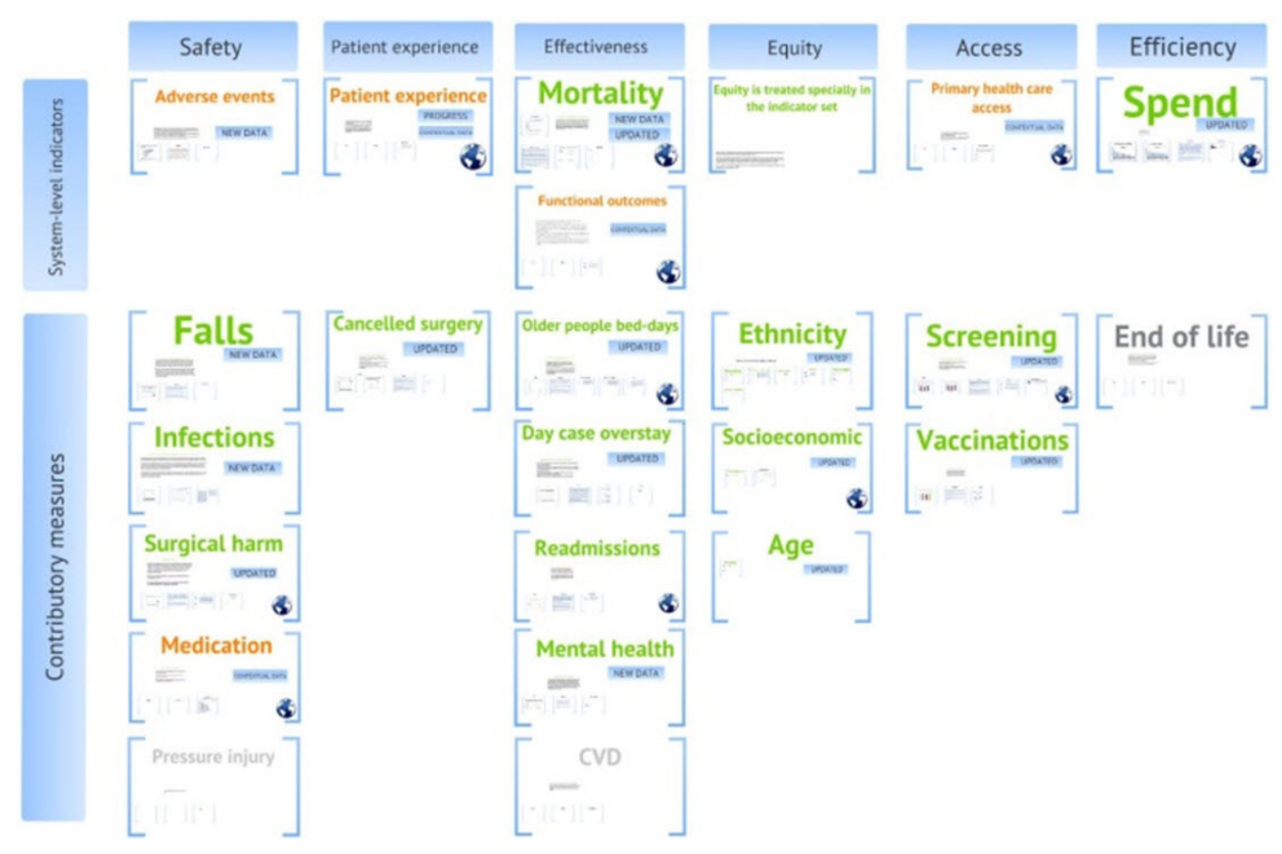
Figure 1. Health quality and safety indicators, June 2014

Source: Health Quality and Safety Commission. Health Quality and Safety Indicators June 2014, <u>http://prezi.com/dbzsrwws2s45/health-quality-and-safety-indicators-june-2014/</u> – click to view enlarged image