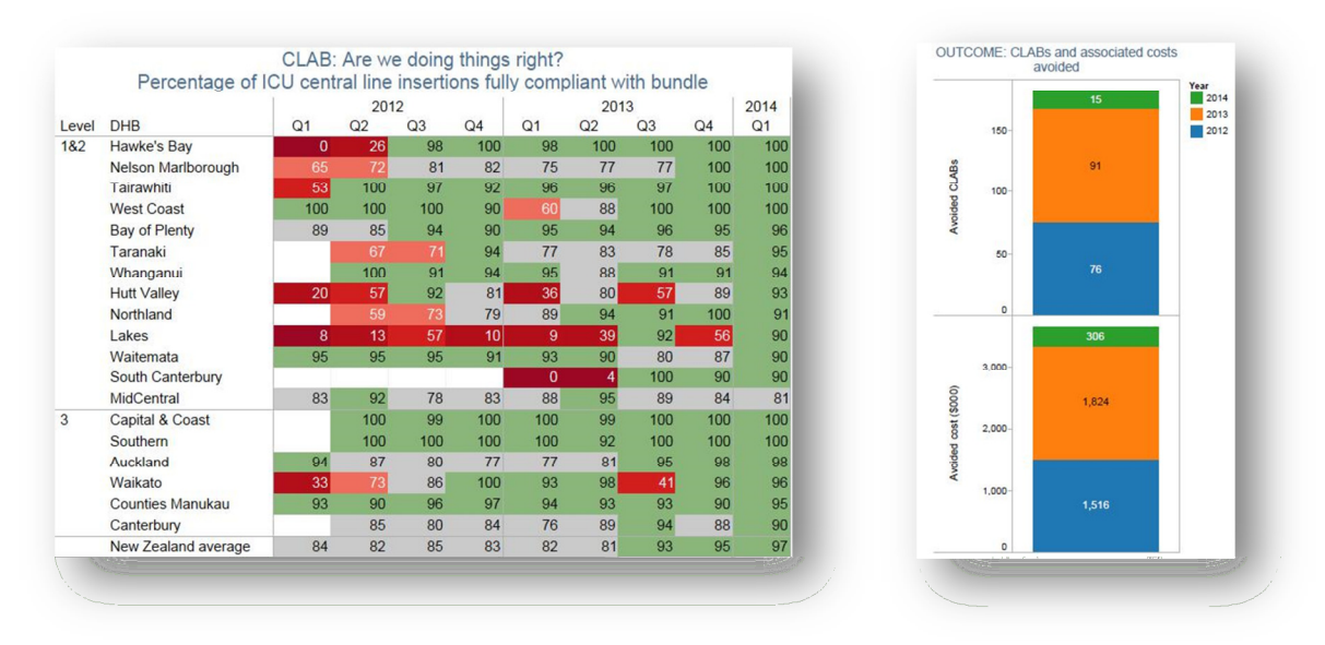
Figure 4. Public reporting of process and outcome measures for central line associated bacteraemia (CLAB) intervention