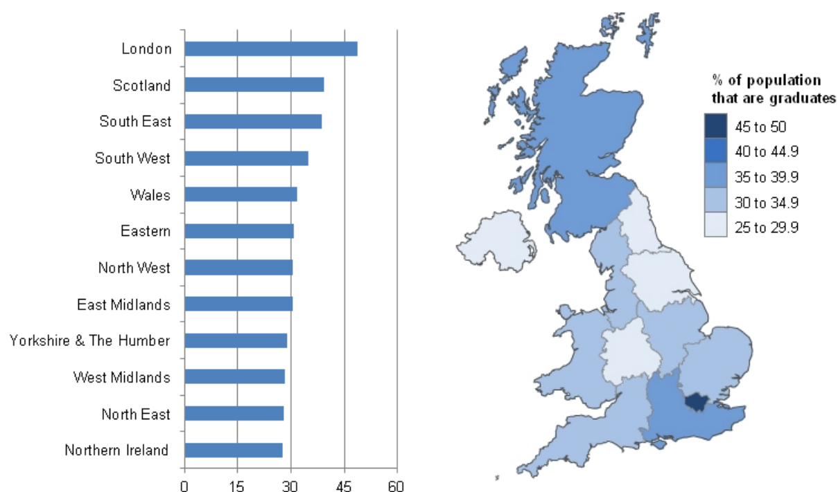
Figure 4: The percentage of the 21 to 64 population no longer in education that are graduates across the UK, 2011 (four quarter average)