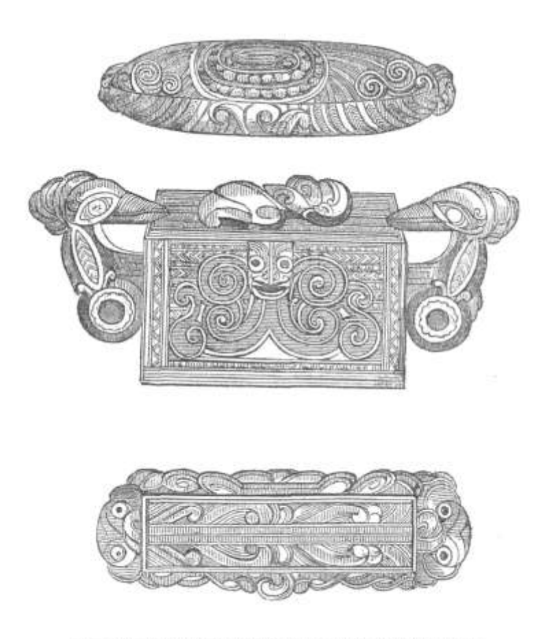
Carred Boxes for the reception of Feathers and Native Ornaments.