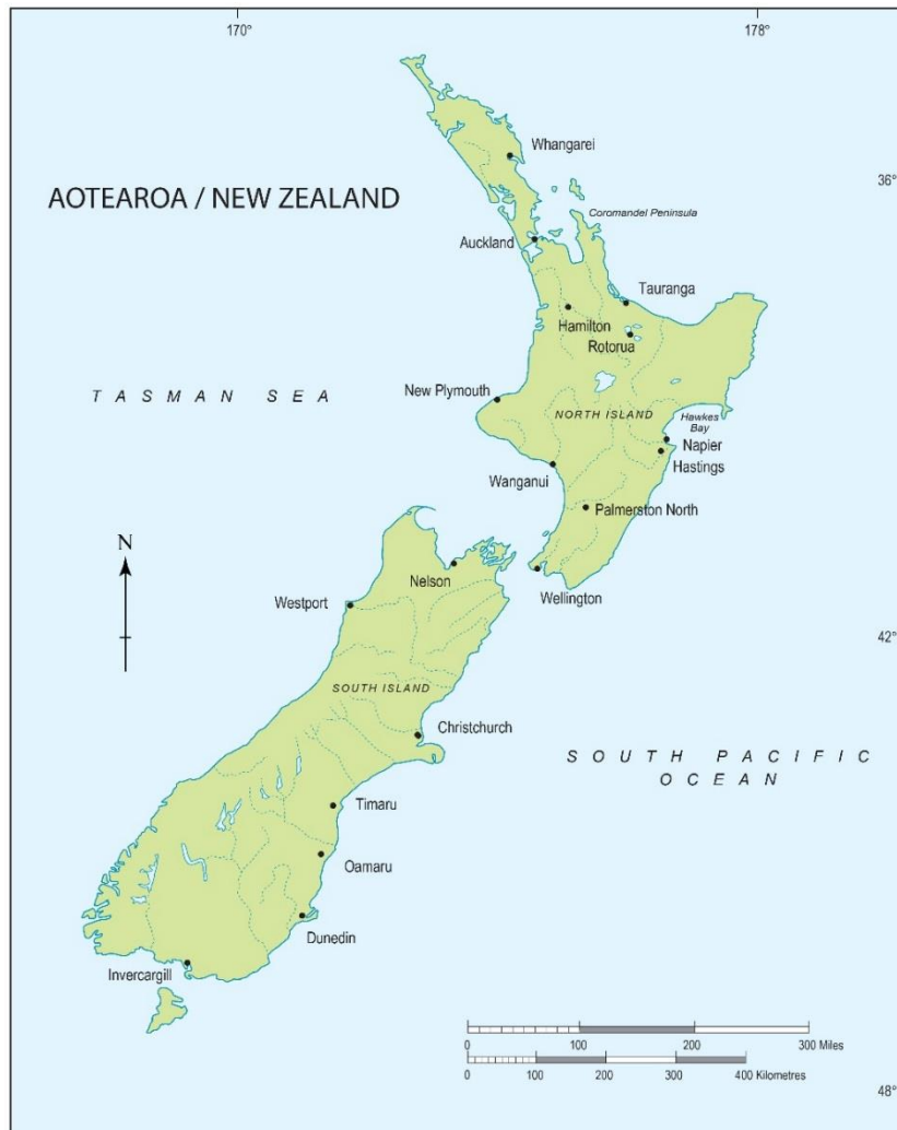
Figure 1. Map of New Zealand

Working with participants in their own homes gave me insights into daily routines. Insights from early interviews helped inform my later interactions, again indicating the advantages of the flexibility and sensitivity of anthropological methods.