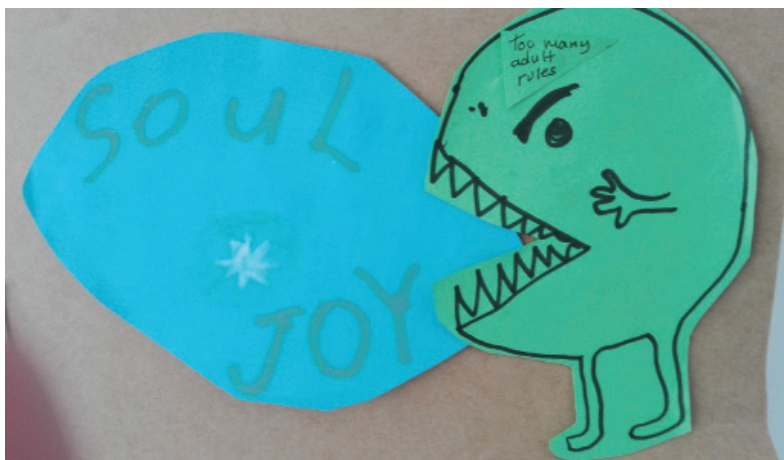
Figure 2: Creative expression from youth focus group: “Shitty adult rules are eating our souljoy”.

this was done by externalising (for example, through a fictional character created for an animation), and occasionally in a more open way by sharing their personal experiences with the group. For one participant, Express Yourself helped them “disrupt repetitive thought patterns”, while another said it helped them to “think about things in my life in different ways—especially working with images”. Another said “I come to learn about myself and relationships”, while a different participant explained that “it teaches useful tips and ideas for dealing with things”. The creative process was described as a safe way to reflect on, share and reframe negative life stories. Doing this among peers in a supportive environment enabled important peer validation and support networks, and modelling of pro-social behaviours. Importantly, individuals also talked about how this process enabled them to be brave and take risks and practice new confidence or behaviours: “I didn’t like it but I gave it a go and no one laughed”. Participants were then encouraged to transfer this to other environments. A number of participants in the second focus group engaged in a discussion about how the arts offer different ways of saying things enabling self-expression, especially in difficult situations.