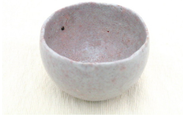
Figure 1: What a wabi-sabi teacup might look like: a modern tea vessel made in the wabi-sabi style.

instead, the opposite of exactitude. We might say that wabi-sabi is concerned with a range of experiences qualified with adjectives such as: earthy, irregular, imperfect, textured, intuitive, relative, ambiguous, contradictory, and so on. Wabi-sabi engages us to appreciate such attributes, finding beauty in the contemplation of objects in which we can recognize them. The classical example is that of roughly hand-made teacups we nowadays often find in Asian stores. Uneven and color patched, they can evoke impermanence, as opposed to the eternal perfection of well-made, seamless china (Figure 1).