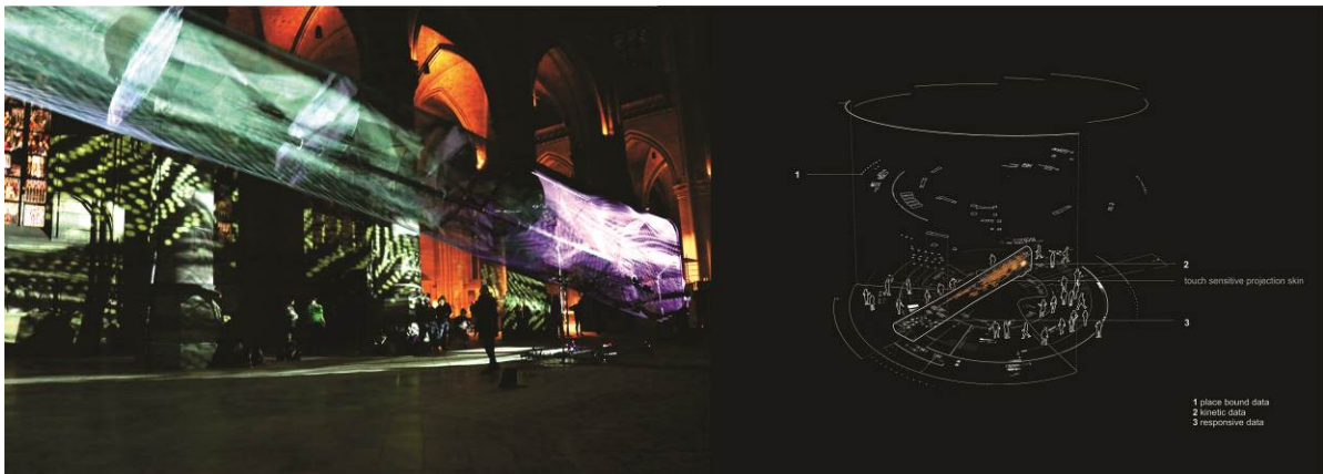
Figure 5 (left). LightScale II , 20 m long carbon construction at the New Cathedral Linz Austria. Figure 6 (right). LightScale II , physical construction and augmented data sets (drawing Yiqiu Hong).

The LightScale II installation (figure 5,6) generates a tactile experience of 3D data through projections onto multiple layered gauze surfaces. The kinetic structure consists of a 20-metre long carbon mast construction, surrounded by multiple layers of black mesh. The construction is mounted asymmetrically on a single pin-point support. On a touch of the visitor this allows the construction to oscillate in space, freely and with almost no friction. A tracking system recognises the position and movement of the LightScale . A live-render program overlays the physical construction with projected digital information. The installation combines three types of data sets: Firstly, place bound information which only appears in specific positions; secondly, tracked data following the kinetically moving object; and thirdly, responsive data which corresponds to the user interaction with the LightScale . Like a giant creature, it floats through a virtual ocean materialising environments, stories and user interactions. The project has its roots in a design by kunst und technik 17 (R. Hartl, M. Janekovic, U. Rieger, H. Schroeder) in Berlin in end 90's. Equipped with latest digital spatial technologies LightScale II now advances towards an responsive navigation tool that creates haptic-digital constructions and materializes spatial narratives.