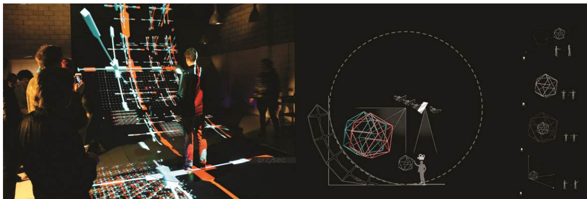
Figure 7 (left). AnaGlyph, 3D digital constructions generated through red/cyan projections Figure 8 (right). AnaGlyph, digital construction overlaid with physical navigation tools.

In collaboration with the South Pacific Department at the Auckland War Memorial Museum, an applied version is currently under development. The aim is to make the museum's extensive data archive on the Pacific Islands, their history and culture, accessible with a specific focus on migration and maritime travel. The new setup will use an advanced tracking system to pick up user interaction with displayed physical navigation tools and artefacts. The setup allows access to information as a new haptic-digital museum experience. The main architectural investigation of this project is the spatial organisation of data and how this data can be combined with physical objects and physical navigation tools