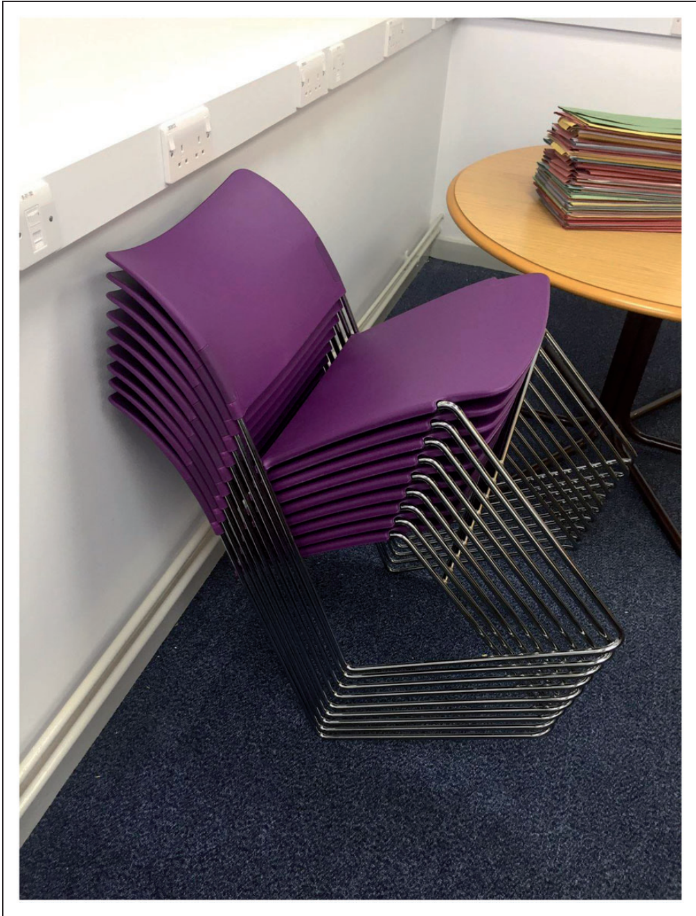
Figure 1. The stacking chairs.

The stimulus superficially calls to mind the Penrose triangle (Penrose & Penrose, 1958), the critical difference between the two being that the latter has no real-world interpretation (it is a paradoxical figure, and geometrically impossible), whereas the former does: A, B, C, D, E and F all being in roughly in the same vertical plane. But the misleading local three-dimensional