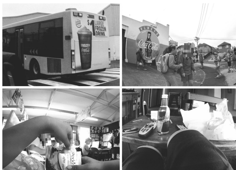
Fig. 3 Sign for sugary drink in public space, sign for sugary drink in public place, product packaging for snack food at school, product packaging for sugary drink at home