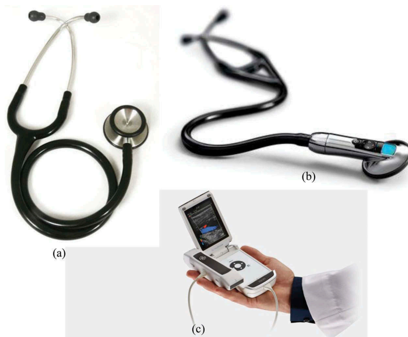
Figure 1. The devices used in this study. (a) A standard mechanical/acoustic stethoscope. (b) A digital/electronic stethoscope. (c) A hand-held echocardiogram device.

Since hearing and auscultation is by nature a subjective process we had to account for inter-expert variability. At each session, the ‘correct’ answer (gold standard) for each of the features on the grading sheet was chosen based on the majority finding of the three consultant cardiologists when auscultating the patients. The consultant cardiologists were blinded to the diagnoses and had to examine the patients in the same way as the students. The cardiologists’ findings were then themselves marked using the