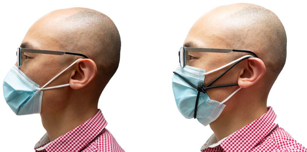
Figure 2: Modifications to improve the fit and performance of medical masks. (Left) Knotting the ear loops and tucking in the side pleats; (Right) placing three connected rubber bands, elastic cords or similar on top of the mask and behind the ears.

The effectiveness of medical masks can be greatly improved when they are modified to improve the seal against the face. They can filter 60-90 percent of particles when modified using various methods, including knotting the ear loops and tucking in the side pleats, placing three connected rubber bands on top of the mask and behind the ears, wearing a cloth mask on top of the medical mask, and adding a nylon hosiery layer. 19, 23, 25 Two of these modifications are shown in Figure 2.