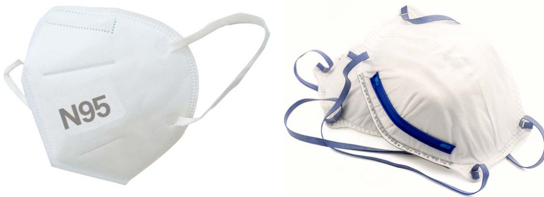
Figure 4: N95 and P2 respirators