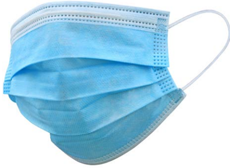
Figure 1: Medical mask