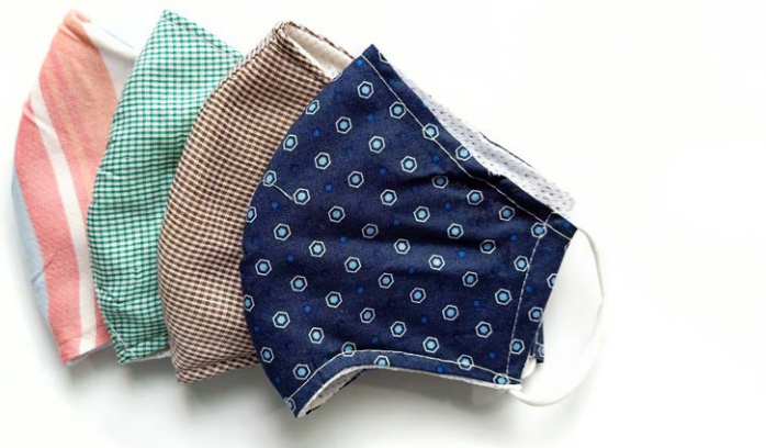
Figure 3: Cloth masks