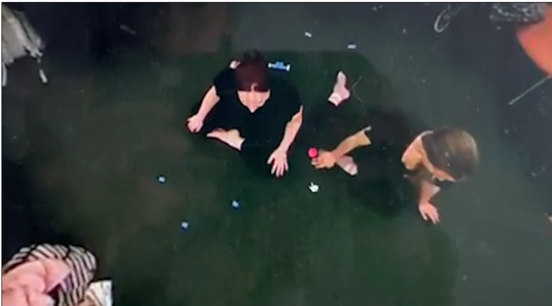
Figure 3: God's-eye perspective.