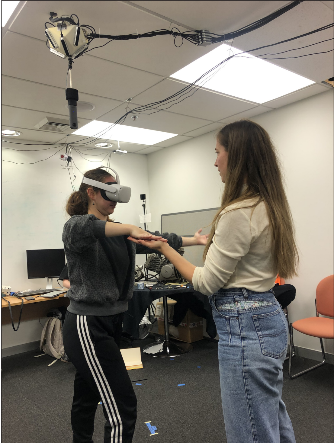
Figure 4: Touch as a grounding point in VR.