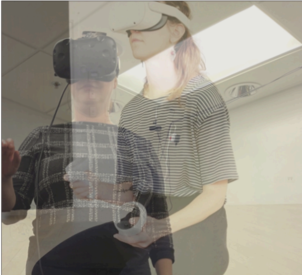
Figure 1: Layering realities.