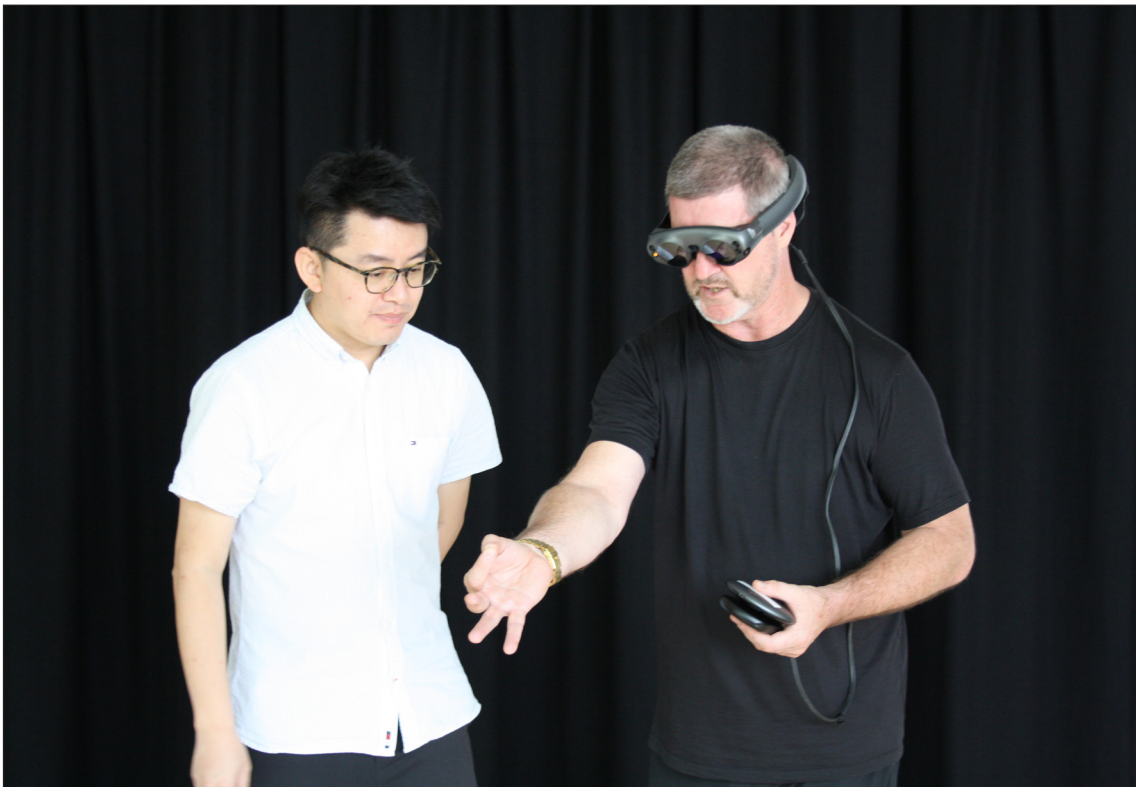
Figure 2: Exploring Augmented Reality in an early workshop.

embodied cognition through creative choreographic practice within XR spaces. It began with a query: how might the shift from studio practice into the virtual realm impact dancers' sense of embodiment? How does the digital environment, which has become so central in dance practice, affect our creativity and sense of embodiment? And how might these altered senses impact an inherently physicalised creative process? As Brown (2006: 85) emphasises, 'In this [virtual reality] context, the "being in the body" of embodiment is radially reconfigured.'