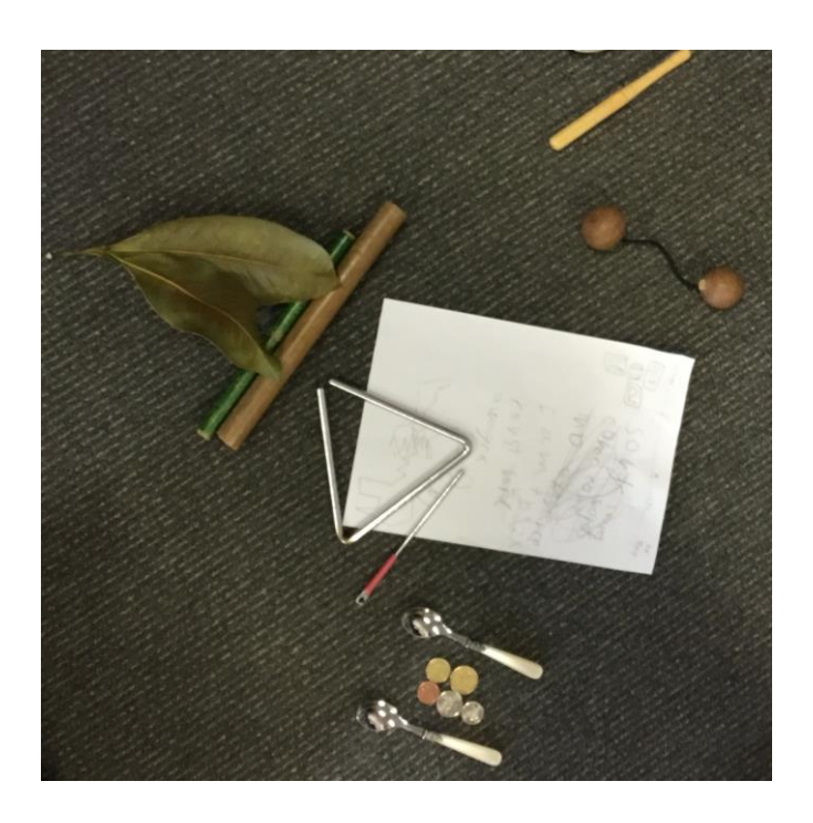
Figure 4: Group soundmakers

One example was TurTwo group's sound story, The First One . These children used a canon structure to represent their topic of a dawn chorus. With a staggered entry, each member played their original Dawn Waiata , then brought their group piece to a finale with a "chorus" in which they all played their