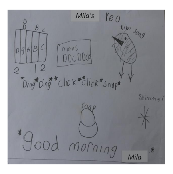
Figure 2: An example of a Dawn Waiata Sound Motif score.

At this point, children re-storied previous learning through music-making. A small group Sound/Song Story was created, scored, shared and named.