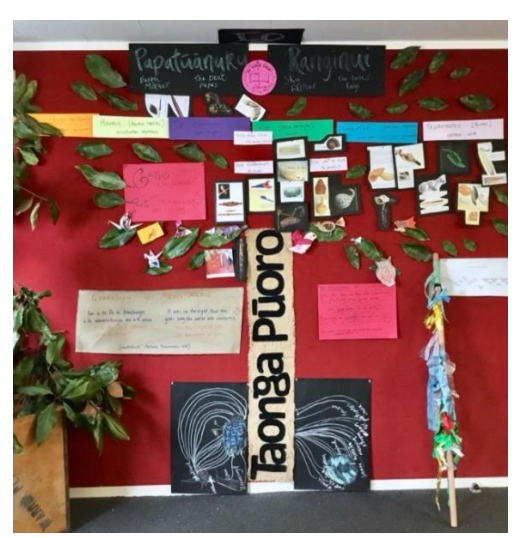
Figure 1: Family tree mural.