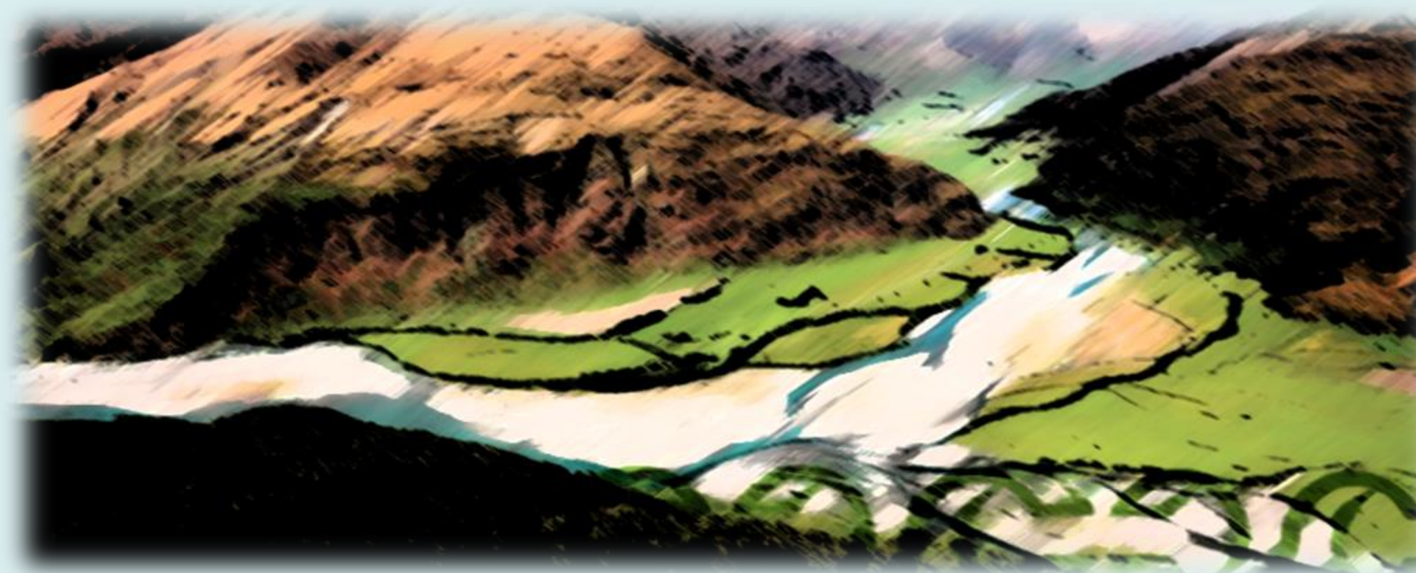
Image of Kawarau River valley